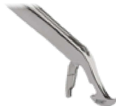
Sixer Right 328312BSM