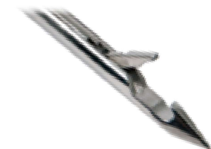
Arthropasser PII 910079 Straight