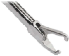
Suture Manipulator Grasper