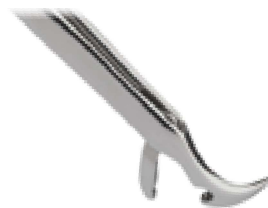
Clever Hook Left 328342BSM