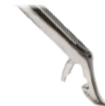
Clever Hook Right 328332BSM