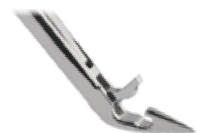
Penetrating Grasper 45° Up 398341BSM