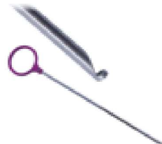
Closed Knot Pusher, Small Hole