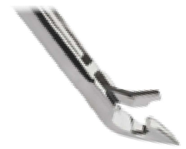
Penetrating Grasper Left 398321BSM