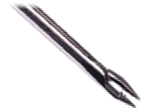
Arthropasser 910075 Straight