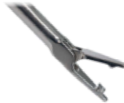
Vampire™ Suture Grasper