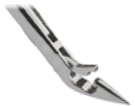
Penetrating Grasper 30° Up 398331BSM