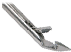
Arthropasser PII 910080 45°, Left