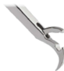
Sixer Left 328322BSM