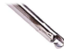
Flush Suture Cutter