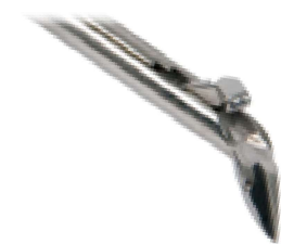
Arthropasser PII 910081 45°, Right