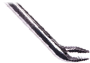
Arthropasser 910076 45°, Up