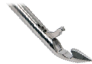
Arthropasser PII 910082 35°, Up