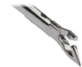
Penetrating Grasper Right 398311BSM