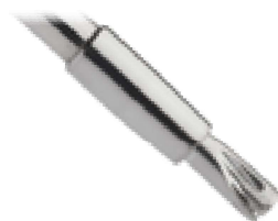
Multi Suture Cutter