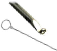
Knot Manipulator, Large Hole