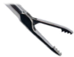
MultiGrasper Tissue/Suture Grasper