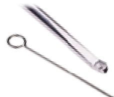
Open Ended Knot Pusher