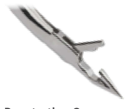
Penetrating Grasper Straight 398300BSM